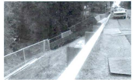
16th Avenue South culvert replacement.

Last summer, Bayside Construction was awarded the contract to restore the stream channel and to avoid, as much as possible, impacting the newly constructed culvert and retaining walls. The project