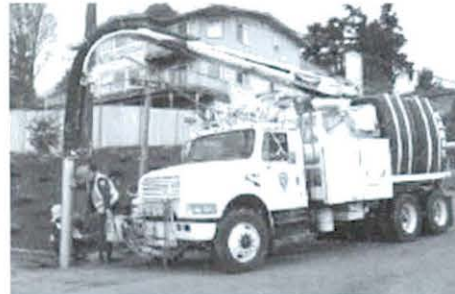
Camel Vactor truck at work.

Additional duties of the SWM crew include cleaning catch basins and pipe flushing with a Camel Vactor truck (see photo below), curb and gutter repairs, grate adjustments before street overlays, repairing or replacing pipe and catch basins. The crew is also responsible for the maintenance of city detention ponds. All work is in compliance with regulations for water quality and habitat protection.