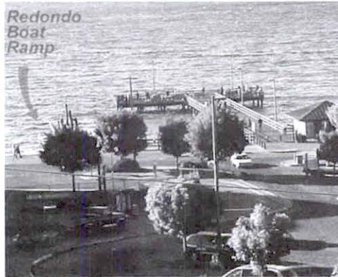
This is a view of the Redondo boat launch area from the condos across the street to the east.

An informational open house will be held on November 7, 2002 . Staff will be available from 4 to 7 p.m. to describe the changes planned, and to answer your questions. The meeting will be held at the Woodmont Library, 26809 Pacific Highway South. This event will be conducted in a "drop in" format so you can arrive anytime between 4 p.m. and 6:45 p.m. If you are unavailable at this time, please call Corbitt Loch at (206) 870-5568 to arrange a separate meeting.