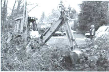
Backhoe work at 14th Avenue South.